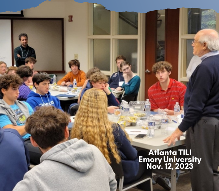
Atlanta TILI Emory University Nov. 12, 2023