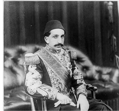
Figure 3 Sultan Abdulhamid II—to whom Herzl appealed for a sanction of support for Zionism. (Library of Congress, Prints and Photographs Division, no known restrictions)