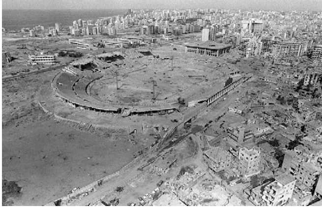
Figure 3 the destroyed Beirut stadium previously used as a weapons depot by the PLO. Reagan's peace initiative immediately followed the exit of the PLO from Beirut (Public Domain).

But the situation in Lebanon is only part of the overall problem of conflict in the Middle East. So, over the past two weeks, while events in Beirut dominated the front page, America was engaged in a quiet, behind-the-scenes effort to lay the groundwork for a broader peace in the region. For once, there were no premature leaks as U.S. diplomatic missions traveled to Mideast capitals and I met here at home with a wide range of experts to map out an American peace initiative for the long-suffering peoples of the Middle East, Arab and Israeli alike.