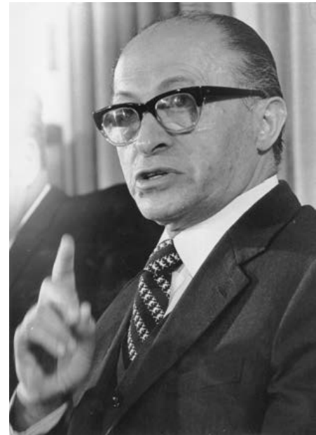
Figure 4 Israeli Prime Minister Begin rejected the Reagan peace initiative.

The successful completion of Israel's withdrawal from Sinai and the courage shown on this occasion by Prime Minister Begin and President Mubarak in living up to their agreements convinced me the time had come for a new American policy to try to bridge the remaining differences between Egypt and Israel on the autonomy process. So, in May, I called for specific measures and a timetable for consultations with the Governments of Egypt and Israel on the next steps in the peace process. However, before this effort could be launched, the conflict in Lebanon pre-empted our efforts. The autonomy talks were basically put on hold while we sought to untangle the parties in Lebanon and still the guns of war.