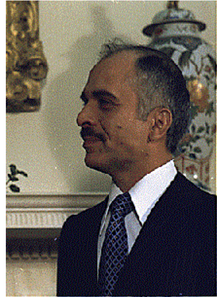
Figure 5 King Hussein ultimately did not embrace Reagan administration peacemaking efforts.

In the aftermath of the settlement in Lebanon we now face an opportunity for a broader peace. This time we must not let it slip from our grasp. We must look beyond the difficulties and obstacle of the present and move with fairness and resolve toward a brighter future. We owe it to ourselves, and to posterity, to do no less. For if we miss this chance to make a fresh start, we may look back on this moment from some later vantage point and realize how much that