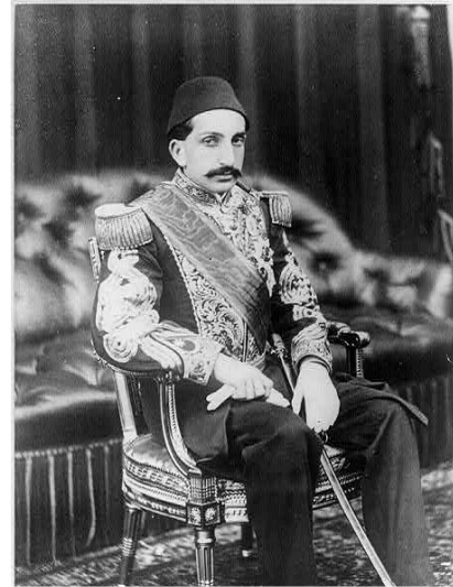
Figure 3 Sultan Abdulhamid II—to whom Herzl appealed for a sanction of support for Zionism.

At the turn of the century, only a handful of Jews immigrated to Palestine, some settling permanently, others testing the settings only to realize the move there was too harsh and thus, for many, their stay was short-lived. Meanwhile, Russian pogroms against Jewish life and property reignited in places like Kishinev, Gomel, Bialystok, and other places, numbering 660 small and large attacks between November 1 and November 7. Herzl renewed a Zionist drive to land permission from Russia or England to sanction a place for a Jewish homeland, but failed. Prior to Herzl’s sudden death at 43 in July 1904, disparate Zionist leaders eventually crystallized a view that both practical (settlement) and political (seeking a charter or permission) should move in parallel, one reinforcing the other. A young Zionist leader who would emerge as an important cog in Jewish nation building over the next forty years, Menachem Ussishkin said that the movement had to attain the charter (permission from a great power or number of powers to build a national home from the top down, and simultaneously through practical work from the bottom up in Eretz Yisrael. As it evolved as a movement, a