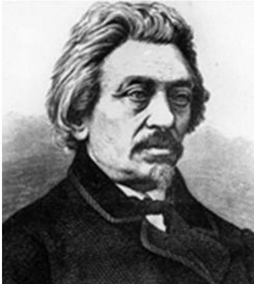
Figure 1 Moshe Hess, one of Herzl's ideological forerunners, and author of "Rome and Jerusalem: The Last National Question" (1862).

year, he was tried, convicted, court-martialed, and incarcerated for allegedly passing information about French artillery capabilities to a German military attaché in Paris. Based on fragmentary evidence and an absence of due process, his case was reopened in 1899. Despite these legal points, Dreyfus was reconvicted and sentenced to another ten years. Finally, in 1906, he was exonerated and released from prison. There is little doubt that the trial gave anti-Semitism stunning notice in what was believed to be an emancipating Europe; “in France it took on the dimensions of a civil war and rent European opinion asunder.” 1